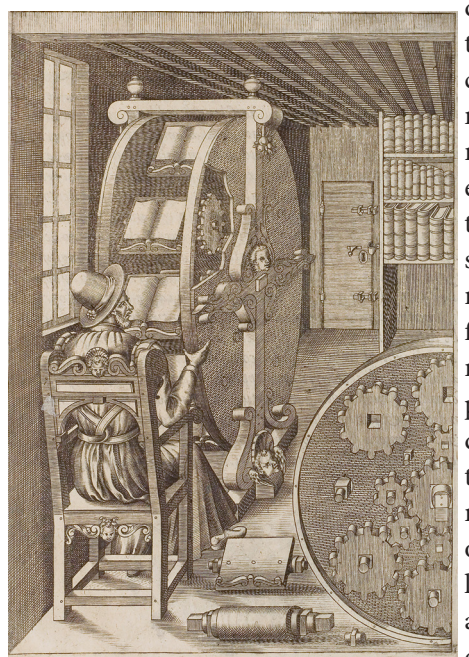
Fig. 4 Bookwheel, from Agostino Ramelli's Le diverse et artifiose machine, 1588

Maria Angel and Anna Gibbs (2013) make the claim that corporeal performance is increasingly characterising acts of reading and writing in digital contexts. In opposition to this, they state that bookish reading and writing is a relatively