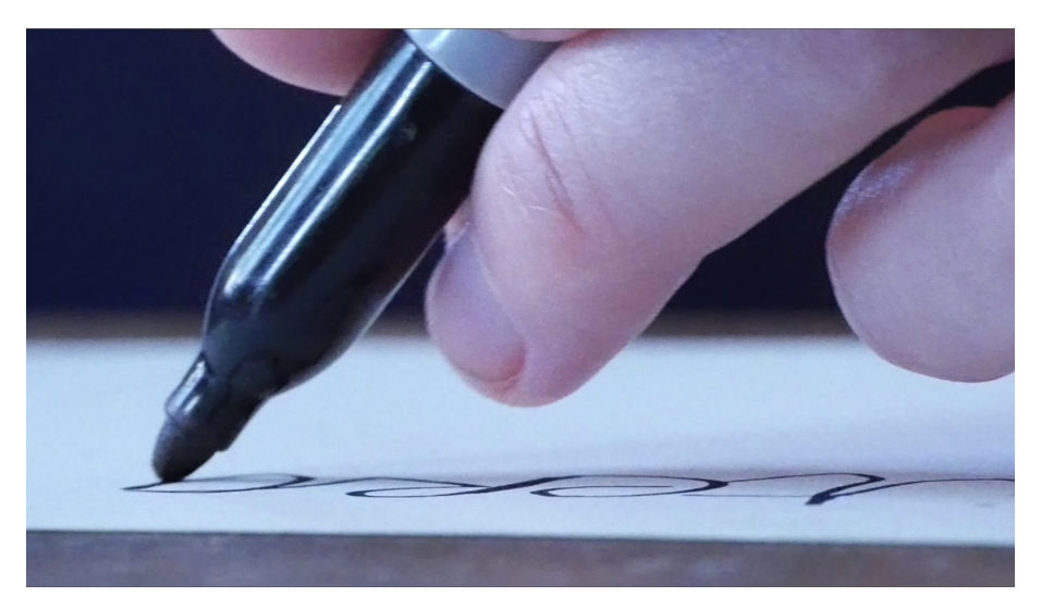
Fig.2 Still from Unruly gestures . The video is available on page 191 and at: https://cultureunbound.ep.liu.se/article/view/255/2577