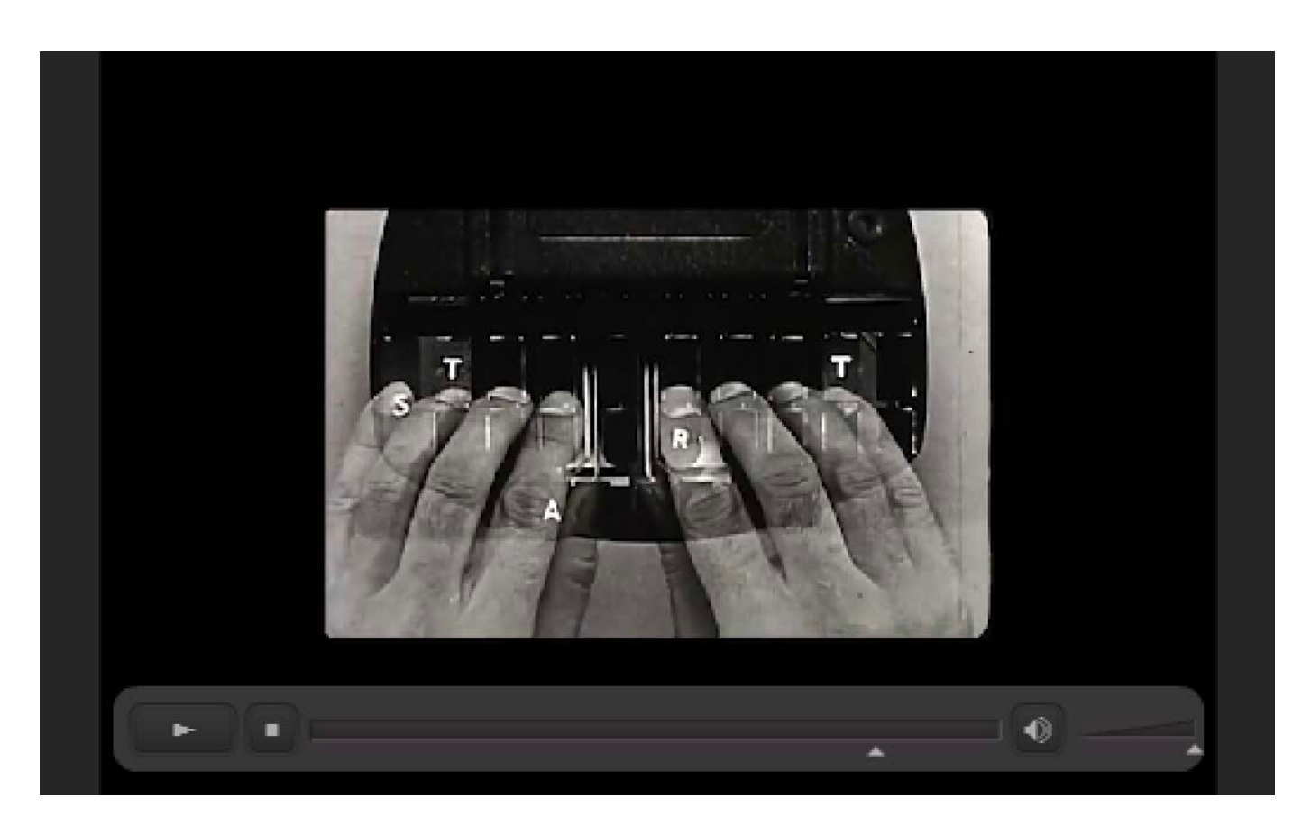
Fig.1 Unruly gestures (10 min). By Janneke Adema and Kamila Kuc. The video can be downloaded via this link: https://cultureunbound.ep.liu.se/article/view/255/2577