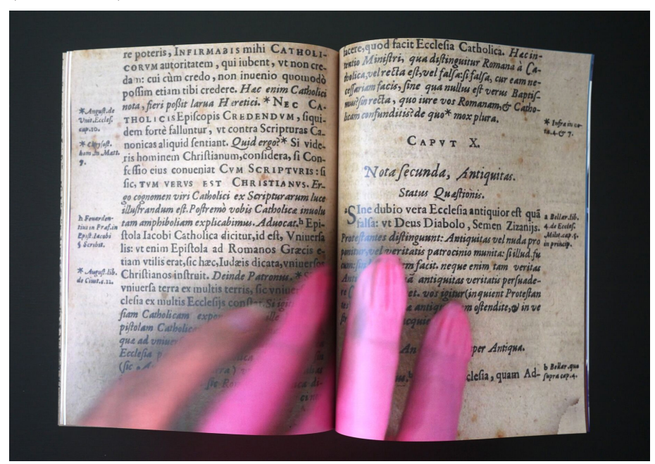
Fig. 5 Paul Soulellis - Apparition of a distance, however near it may be (2013). New York: self-published, 2013. 42 pages, print-on-demand, unlimited edition.

derlying digitised images, making visible the material tactics and the ideologies behind Google's digitisation project. These works clearly demonstrate (quite literally in these examples) how reading/writing gestures interfere in, influence and shape knowledge transmission and production. As Soulellis emphasises, they are 'permanently altering the viewer's perception of the content' (Soulellis n.d.). Even more these specific gestures show a glimpse into the workings of neoliberal capitalism, and into the pervasive manual character of the human labour behind Google's digitisation effort. Indeed, this gives us more insight into the racialised, segregated and unseen nature of this labour, revealing, as Soulellis states, the 'anonymous workers that are typically flattened or hidden behind digital production' (Soulellis n.d.).